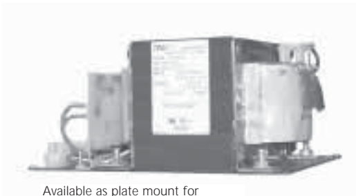
Available as plate mount for mounting within an enclosure.